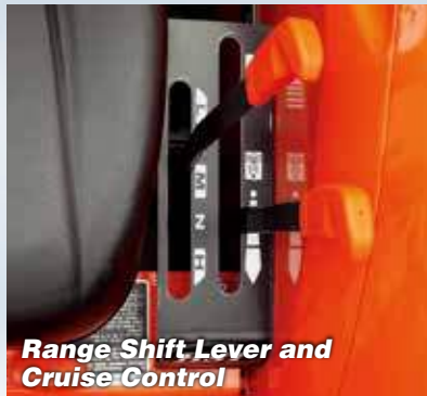
Range Shift Lever and Cruise Control