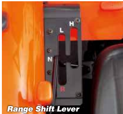
Range Shift Lever