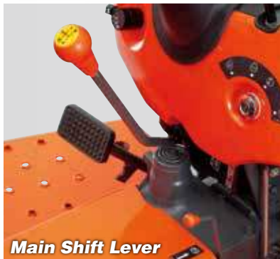
Main Shift Lever