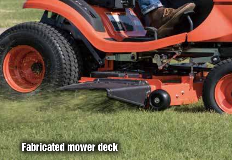
Fabricated mower deck

Step up to the Kubota T Series and get more of everything you want in a premium lawn tractor. More comfort to keep you relaxed and refreshed. More convenience to make the job easier. More efficiency to get the job done fast. And, of course, more Kubota dependability and durability to keep your T Series doing what the T Series does best: making your lawn look great.