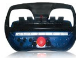
Radio Control option available