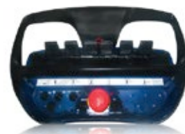
Radio Control option available