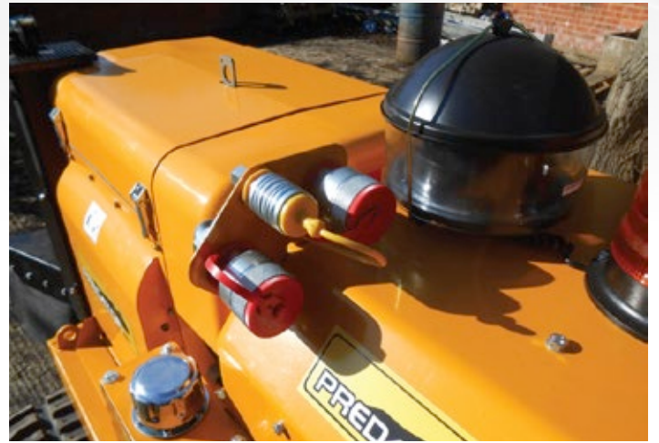
Hook up any attachment with the P50RX rear hydraulic PTO