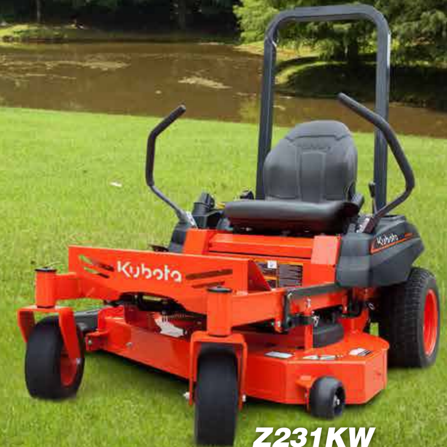
Z231KW with 42" deck

Mow Your lawn like a pro, with the smooth, effortless performance of the Z200 Series.