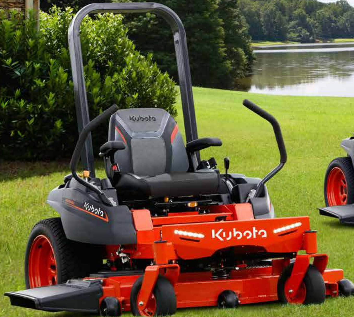
Z231KH/Z251KH with 48", 54" decks

Kubota's residential innovation turns mowing into a power trip and manages to keep your budget trim, too. The Z200 Series maneuvers through landscapes with comfort and ease. Have it all - style, comfort and performance, matched with Kubota's excellence in quality and durability. Engineered especially for the homeowners with exclusive, easy-to-use features.