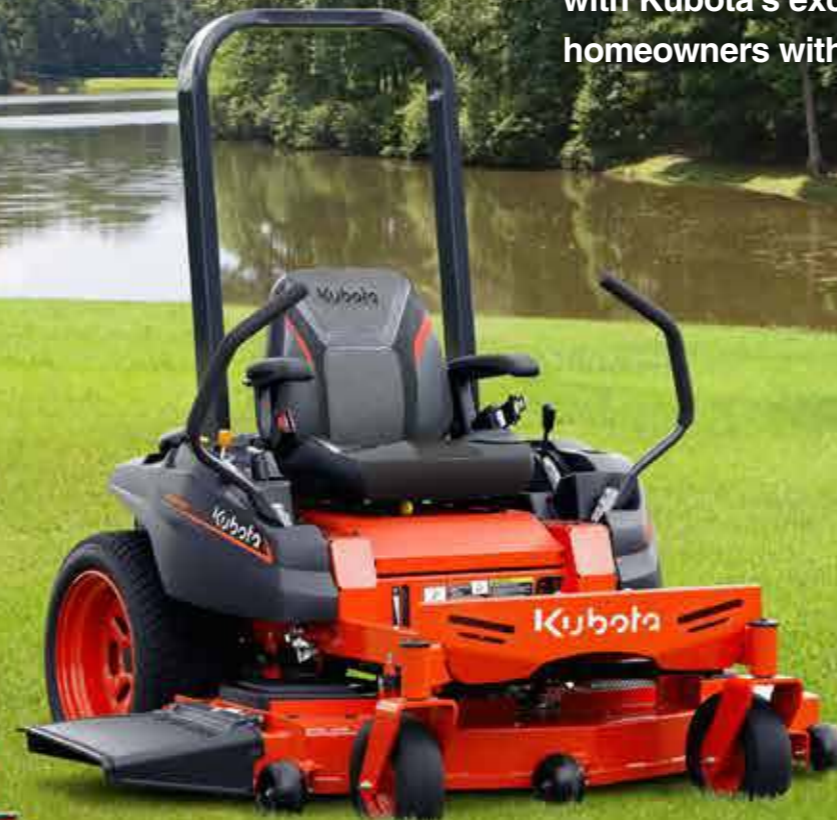
Z231BR/Z251BR with 48", 54" decks

Equipped with LED Headlights and Full Seat Suspension